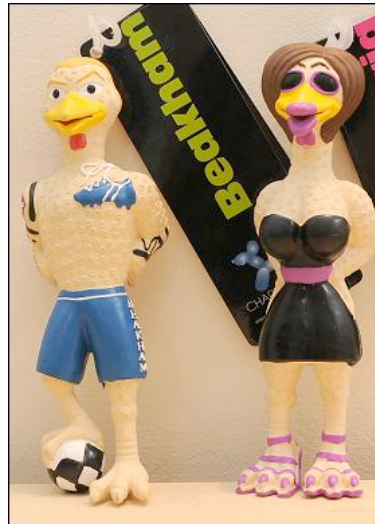
CLUCKING MAD ... Beakham and Chicktoria